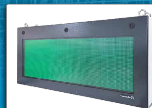
XC50-192.064- readable from two sides

Double-sided displays for hanging above production lines in automotive manufacturing. The information displayed can be the same on both sides or independent of each other. The display can therefore be operated by the customer exactly according to their needs with minimal effort.